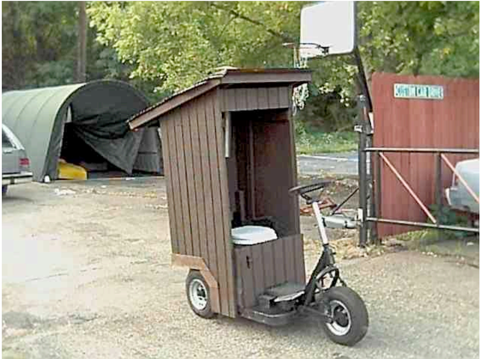
Alternative fuel vehicle